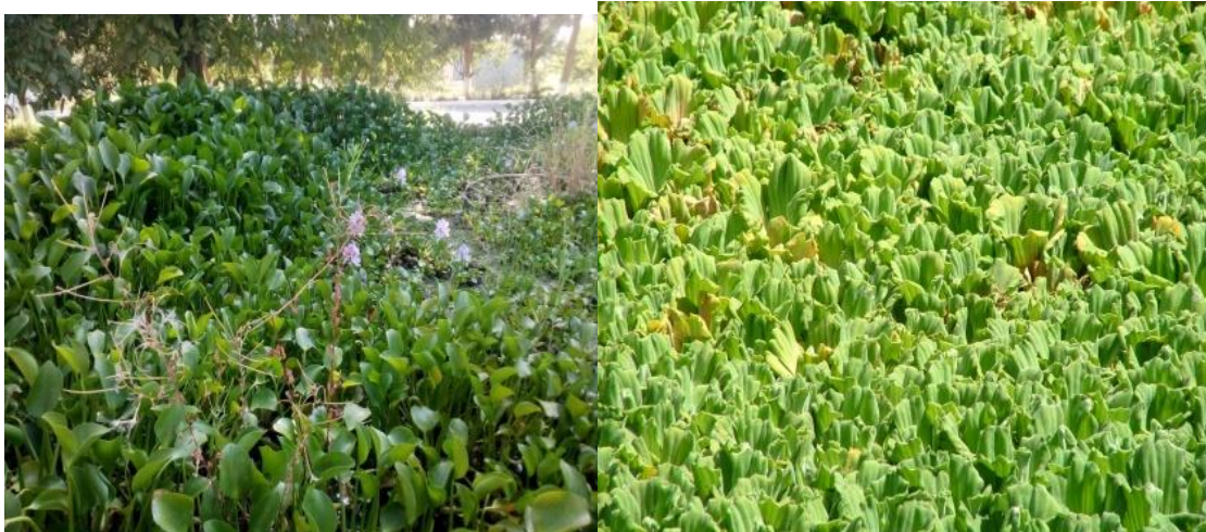
Picture 3. Pistachio grown in bioponds of Dangara bread production industry.

According to these data, pistachio biomass grown in the wastewater of Dangara bakery has an average of 21.1% protein, 2.65% fat, 27.5% fiber, 8.0% moisture, 5.43 % ash, 23.68 mg/kg. It was found that carotene is present, one kilogram of pistachio biomass contains 0.40 nutrient units (exchangeable energy is 59.13 kcal).