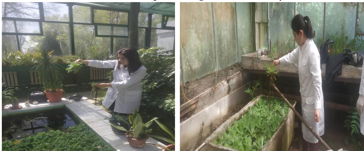
Picture 2. Breeding of aquatic plants in greenhouse conditions in winter.

Pistia reproduces vegetatively with the help of a stolon, which is formed in the leaf axil. A new growth is formed at the edge of the stolons. A young plant usually has 4 leaves on the growth cone. During the growing season, 4-5 circles can be formed on one plant. Different substances are biochemically oxidized at different rates. Professor V.T. According to Caplin, easily oxidized-"biological softeners" include: formaldehyde, low aliphatic alcohols, phenol, furfural, and others. Their oxidation rate constant ( K ) is 1.4-0.30 \text{sut}^{-1} . The middle place ( K 0.30-0.05 \text{sut}^{-1} ) is occupied by cresol, naphthol, xylenol, resorcin, pyrocatechin, pyrogallol, anioactive PAV and others. Slow-degrading