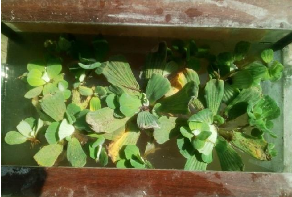
Picture 1. General view of pistachios grown in laboratory conditions.

The pistachio fruit is a dry, unopened fruit with many seeds. The seeds are long-cylindrical (1.5-3 mm) and the weight of 1000 seeds is 2.1-2.2 g.